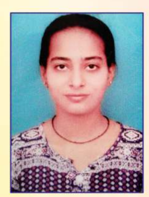
All Round Best ANU